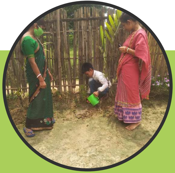
WORLD ENVIRONMENT DAY CELEBRATION STAYING AT HOME