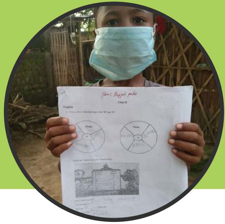
STUDENTS LEARNING IN HOME